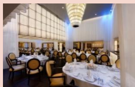
The Restaurant is a beautiful fine dining venue