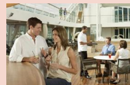
If dining outdoors is a favorite of yours, visit the Sky Grill .