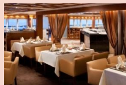
The Colonnade is a more casual alternative with indoor/outdoor seating