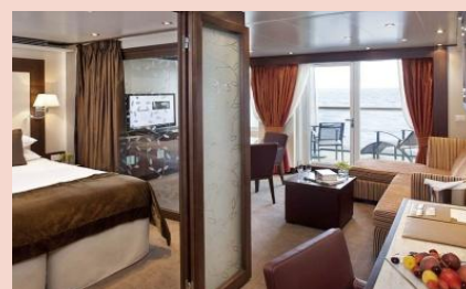
Penthouse Suite Approx. 534 sq. ft.