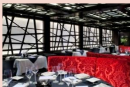
Restaurant 2 is a delightfully different alternative