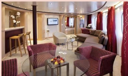
Owner's Suite Approx. 760 – 1,067 sq.ft.