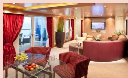
Wintergarden Suite Approx. 1,097 sq. ft.