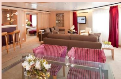
Signature Suite Approx. 1,352 sq. ft.