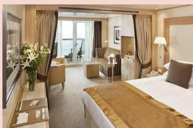
Veranda Suite Approx. 365 sq. ft.