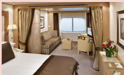
Ocean View Suite Approx. 295 sq. ft.